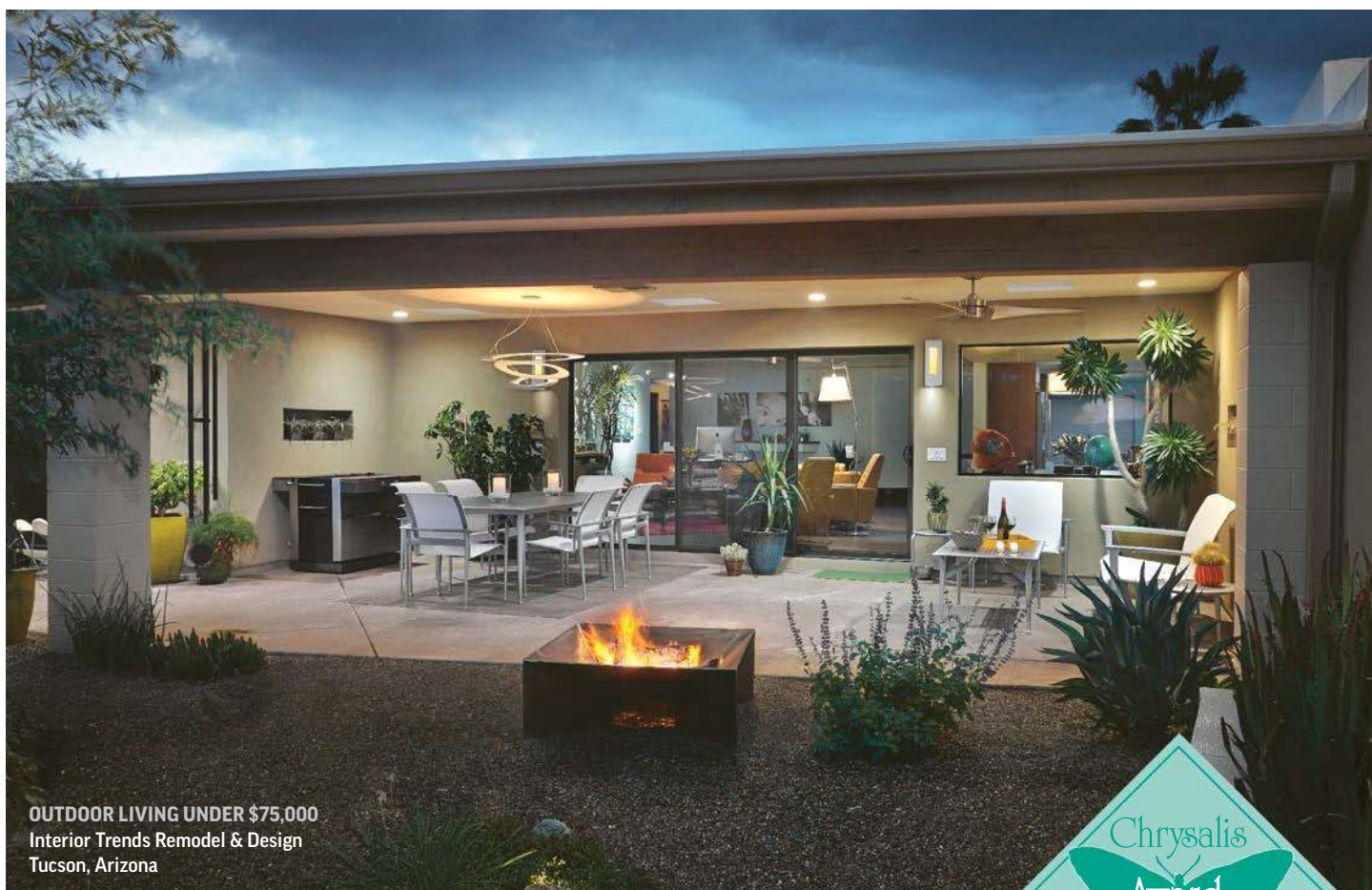
OUTDOOR LIVING UNDER $75,000 Interior Trends Remodel & Design Tucson, Arizona